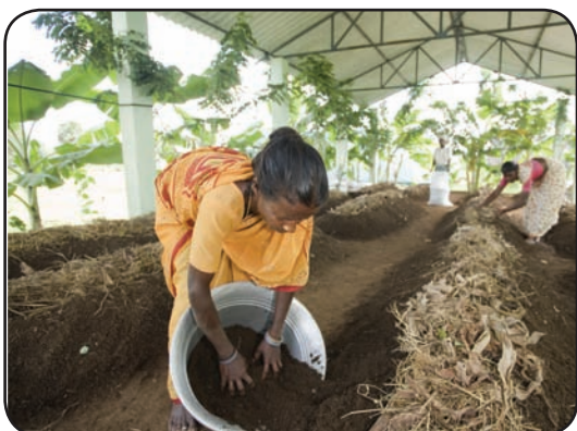
Harvesting of Vermicompost

In our experimental farm at Sukkankollai, crops like brinjal, groundnut, water melon, paddy, pulses and medicinal gourd have been cultivated. Different vegetable varieties like radish, ladies finger, onion, country bean etc., have been raised in the kitchen vegetable garden. Kullakar paddy variety has been cultivated in 42 cents following SRI method of cultivation. Vermicompost production and Azolla cultivation are in progress.