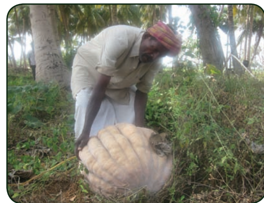
Traditional Pumpkin Variety Conserved in Ramanathapuram District

Our centre is involved in the promotion of organic farming in Alangadu village of Nagapattinam district from January 2009. Black gram has been cultivated in 24.65 acres by 24 farmers. Beneficiaries are also involved in the cultivation of fodder grass organically. On 13th January, an on farm training on pest and diseases and their management measures was conducted for the beneficiaries following Farmers' Field School (FFS) method. On 18th January, a training programme on paper bag production