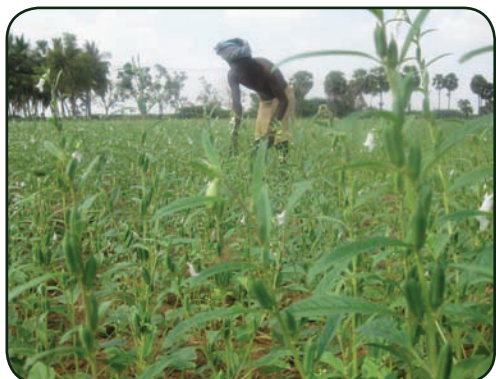
Organic Sesame Field in Kalathupatty Village of Dindigul District

This project supported by Jamsetji Tata Trust (JTT), Mumbai is in progress in Kancheepuram, Ramanathapuram, Dindigul and Nagapattinam districts of Tamil Nadu from May 2009. Production