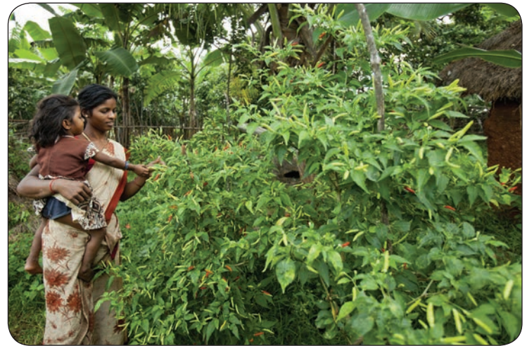
Nourishing home garden with indigenous crop varieties

Availed suitable schemes from these Government Departments.