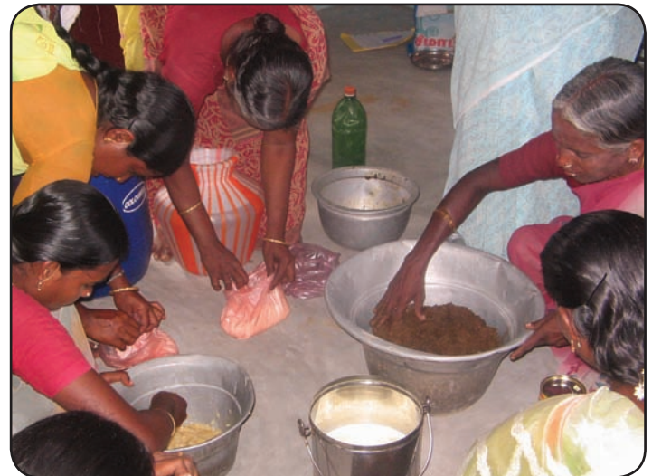
Practical training on biopesticide preparation conducted for women beneficiaries