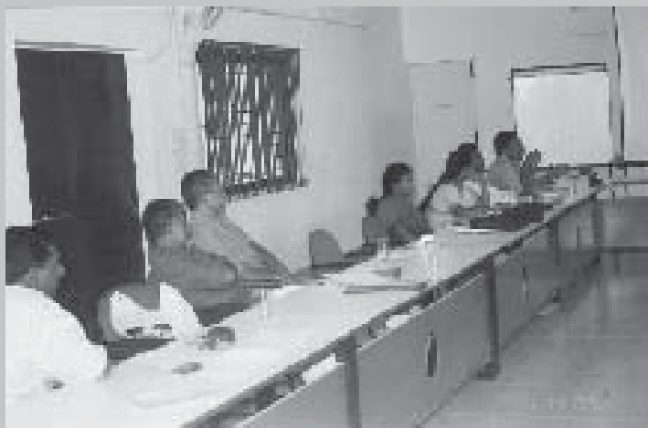
Inception Meeting on Use of Animal Products

During the current project period, field trials have been commenced in three of the project areas. CIKS is involved in experiments for testing the use of modified Panchagavyam and its variations on the growth of paddy crop in Nagapattinam district of Tamilnadu. KPP is involved in testing the effect of cow and buffalo urine on paddy, amaranthus and cucumber crops in Shimoga district of Karnataka. IDEA is involved in testing the use of goat manure as a growth promoter for some selected winter crops in the Vishakapatnam district of Andhra Pradesh.