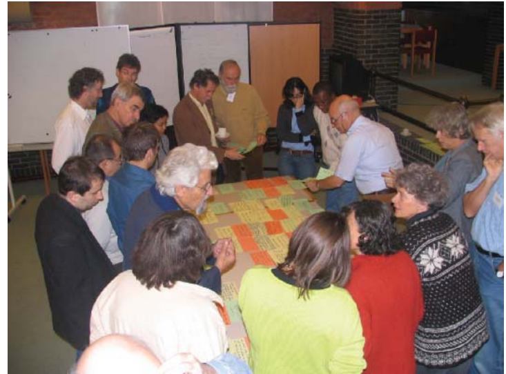
Discussion during European Workshop

A European workshop on reshaping sciences, policies and practices for endogenous sustainable development was held between 28th – 30th November 2005 in the Netherlands. Compas had facilitated this workshop in collaboration with Centre for Development and Environment of the University of Bern, The Foundation for Environmental Consciousness (Stim) and The European Centre for Development Policy Management (ECDPM). The worldviews held by the general public, policy makers and scientists were becoming increasingly diverse, reflecting the growth of multiculturalism, new scientific insights, globalisation and individualisation. More and more people were finding it difficult to accept conventional, materialistic and science-based approaches for the development. Compas partners concluded that the traditional worldviews and practices were weakening under the influences of other cultures. They observed that this creates serious problems for sustainable development and cultural diversity and accepted that the economic and cultural influences from the West were threatening. For Compas, this had raised the need for further analysis of relations between moving worldviews, sustainable development, innovative practices and effective partnerships. Compas, in collaboration with other innovative organisations, was organising a series of workshops. In the second half of 2005, three continental workshops were held in Africa, South America and Europe