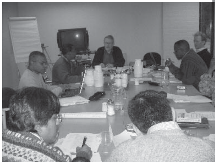
Compas International Management Meeting

A meeting of the International Management Group of the Compas programme was held in Holland between 5th - 9th December 2005. The meeting was attended by all the regional and sub regional coordinators from Africa, Asia, Latin America, Europe and also by the Compas international coordination team. During the meeting, there was a detailed exercise to review the progress of Compas field projects in various regions. Informations regarding the regional activities in Asia, Africa, Latin America and Europe were also presented and reviewed. In continuation of overall progress of the Compas project, discussions were held regarding future activities including a forthcoming meeting of all the Compas partners to be held in September 2006 and also an international conference on the Compas UC programme which was being planned in Switzerland in October 2006.