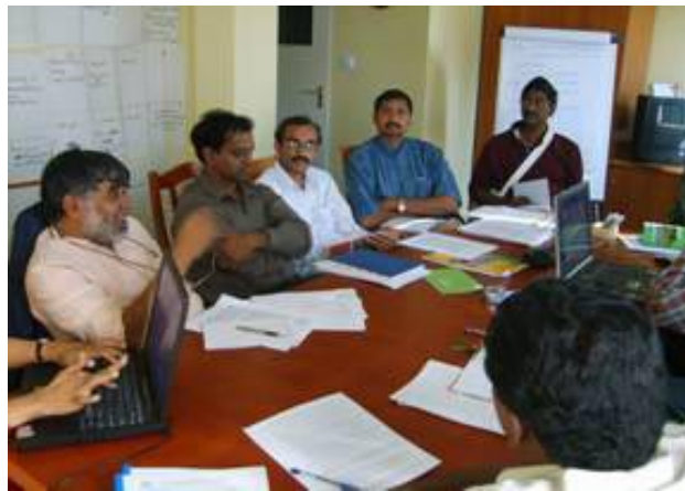
Asian Delegates during a small group discussion

A meeting of all the COMPAS partners took place at Lezajsk in Poland between 17th and 30th September 2006. Representatives from COMPAS partner organizations in all parts of the world and members of the COMPAS International Coordination unit participated in the meeting. The meeting was held with the objective of a major review and exchange of experience between the COMPAS partners regarding the current phase of the COMPAS programme (January 2003 - December 2006). It was also meant to make plans and preparations for the future phase of the COMPAS programme (2007-2010). Some of the activities that were carried out during the meeting were –