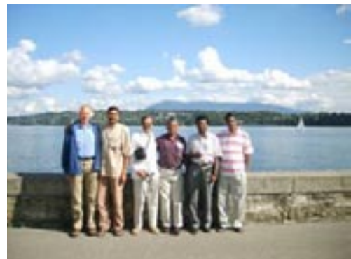
Delegates near the Geneva Lake

Overall, the conference was an opportunity for the COMPAS partners to share and assess experience on the Endogenous Development with various other groups. Above all, the partners were able to strengthen the bond of strategic alliances and explore options for collaboration between community-based organizations, NGOs, scientists and policymakers aiming at Endogenous Development. A core group has been formed of persons who have volunteered to further develop the plans and ideas in the statement of commitment.