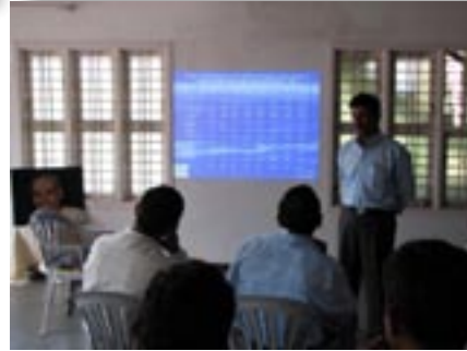
Participants of the workshop

Krishi Prayoga Pariwara (KPP) conducted a one day workshop on "Prioritisation and Validation of IK" with special reference to paddy at Thirthahalli on 22nd December 2006.