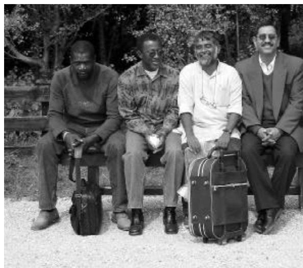
Compas Regional Coordinators at the IMM Meeting

gramme for research, action and publications during the current phase. It was also agreed that during the initial period of this phase the partners would each undertake a "Community diagnosis" of Indigenous resources in their respective field areas. This would serve as a guideline for planning the field work by the partners for the Compas programme from January 2004 onwards.