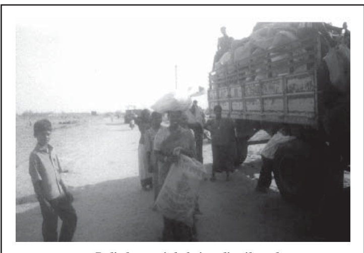
Relief materials being distributed.

Reported by Sirkazhi Field Station Team, CIKS