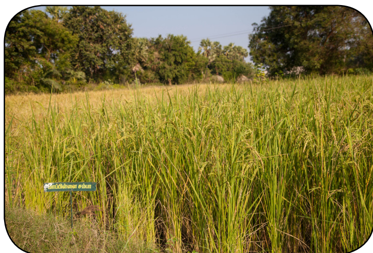
Conservation field of Traditional Paddy Variety - Maapillai Samba

During the course of this year, around 50 training programmes were conducted for the farmers throughout Tamil Nadu on the cultivation, conservation and importance of indigenous paddy varieties. Besides this, nearly 2000 farmers visited the conservation sites for the practical exposure to observe the varieties and learn about them. Awareness programmes for general public and schools were also conducted which covered around 1000 participants. A study was commissioned to understand the cooking qualities of identified 20 varieties which would be communicated as information material when these varieties are marketed. To upscale the efforts of preserving these varieties, marketing is an important component. The varieties that have been cultivated on a larger area of land have been procured by one of the Producer Companies promoted by CIKS. Nearly, 40 tonnes of grains have been procured by providing the farmer with a premium price. Efforts are also on to undertake home delivery of some of these varieties to urban consumers. A consumer survey is in progress.