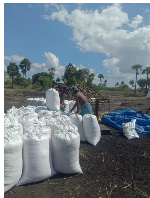
Procurement of Traditional Rice Variety Kuzhiadichan in Ramnad District

pettishops, poultry incubation unit and fodder cultivation. Under this project, a health camp, a veterinary camp and three street plays were conducted in the month of July. An exposure visit was organised for the project staff, CEO and BoDs of Managiri FPC and representatives of Village Participants Committee to JISL Mango Farm in Udumalpet on 6 th September. They learnt various techniques like planting density, pruning methods, cultivation practices from saplings to harvest and marketing. Project Implementation and Monitoring Committee (PIMC) meeting was conducted on 30 th September at Thiruvannamalai. On 6 th November, Mr. Rawoof Shaikh, Manager, NABARD visited the project sites in Jawadhu hills along with Mr. V. Sreeram, DDM, Thiruvannamalai. Necessary equipments were purchased for the value addition unit.