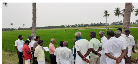
Seeds Training - Kalanjiyam Seed Farm Visit