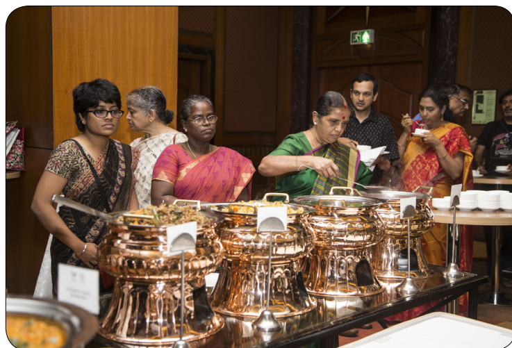
Lunch with Traditional Rice Varieties