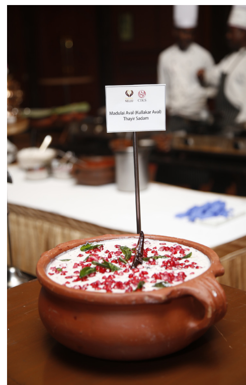
Curd Rice with Kullakar - A Traditional Rice Variety