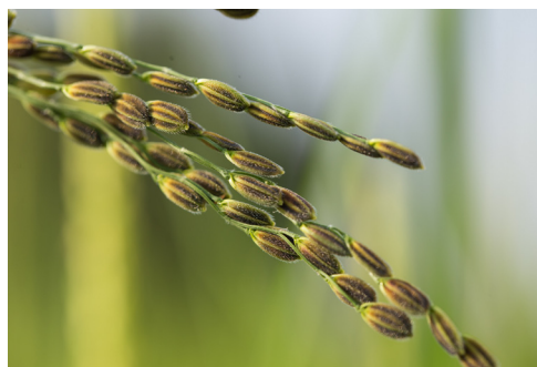
Sivappu Kuruvikar - A Samba Rice Variety Rich in Iron