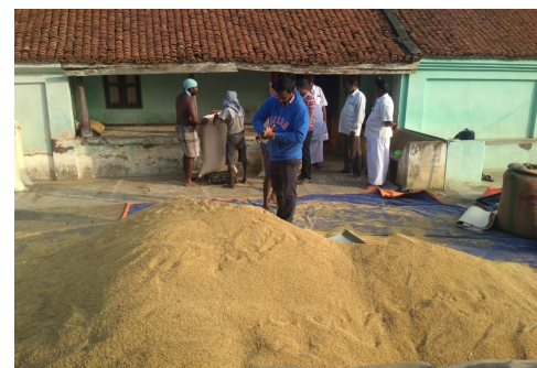
Quality Checking of Seeraga samba in Pudupalayam Field Area