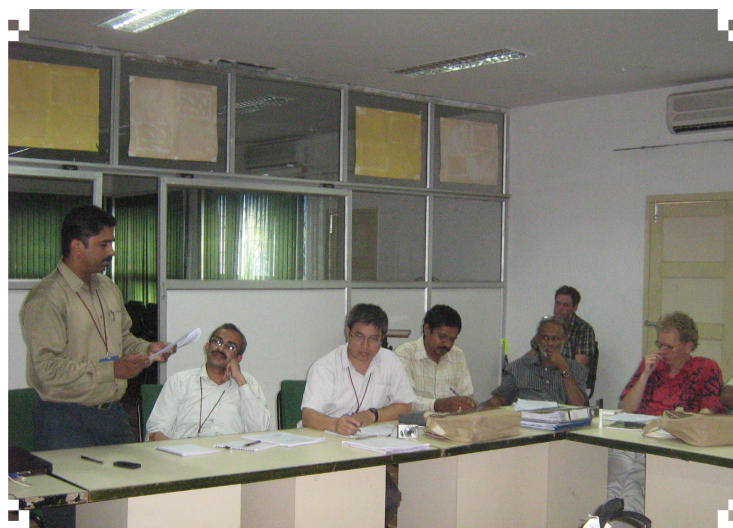
Participants of the meeting